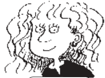
3 Mercedes /ɪz/

2 Listen to the headless sentences. Pay attention to the sound of the -s and -es verb endings. Is it /s/, /z/ or /ɪz/?